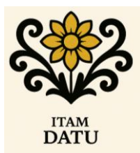
Figure 4. Black Datu Ornament