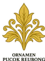
Figure 2. Ornaments of Pucok Reubong

The Pucok Reubong ornament is an ornament in the form of tendrils or plant shoots that tower upwards and are usually part of the bride's crown or headdress. This ornament symbolizes high ideals, hopes for a bright future, and the spirit of continuous growth. In the context of marriage, Pucok Reubong is a symbol of the family's prayers and blessings to the bride and groom so that they continue to grow in wisdom, maturity, and success in building a household. Its towering shape suggests a spiritual direction and purity, namely the hope that the household that is built always leads to the values of goodness, blessings, and is always under God's protection. In addition, Pucok Reubong also reflects the philosophy of Aceh which values the values of effort, hard work, and courage in facing life's challenges.