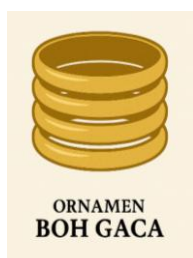
Figure 3. Glass Ornaments

The Boh Gaca ornament itself is the main ornament in this tradition, in the form of tiered bracelets worn on both wrists of the bride. These bracelets are arranged in layers and are generally made of brass or gold, each level of which symbolizes the phases of a woman's life, from childhood, adolescence, adulthood, to becoming a wife and mother. Boh Gaca is a visual representation of the increasing responsibility along with changes in a woman's social and biological status. In the view of the Acehese people, married women are required to be able to maintain their honor, their husband's family, and uphold customary and religious values. Therefore, Boh Gaca not only beautifies the appearance of the bride, but also contains a strong moral and cultural message, namely about the importance of physical and spiritual readiness in entering married life.