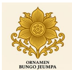
Figure 1. Jeumpa Flower Ornament