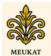
Figure 5. Meukat Ornaments Source: processed by researchers, 2025

Meukat ornaments are forms of fine carvings found on various jewelry such as Boh Gaca, crowns, chest pins, and other accessory parts. Meukat is a work of local art that is passed down from generation to generation and reflects the refinement of manners, precision, and artistic intelligence possessed by the Acehese people. These carving motifs usually take the form of flora, tendrils, and geometry typical of Aceh which are full of meaning, such as fertility, harmony, and unity. In addition to beautifying the appearance of ornaments, Meukat is also a symbol that a woman's beauty is not only seen from her appearance, but also from the intelligence, ethics, and local wisdom that she holds firmly. Thus, the variety of ornaments in the Boh Gaca tradition in Beutong District is not just an aesthetic element, but a symbolic device that is full of cultural meaning, spiritual values, and the philosophy of life of the Acehese people. These various ornaments are a visual representation of traditional teachings passed down from generation to generation, which not only beautify the appearance of the bride and groom, but also enrich the meaning of marriage in a social and cultural context. Preserving this tradition is important not only as an effort to maintain local cultural identity, but also as a means of education and passing on noble values to the younger generation of Aceh.